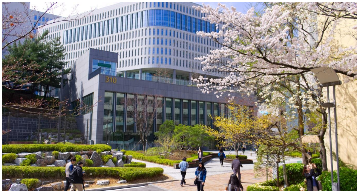
Centennial Building (Bldg. #310)